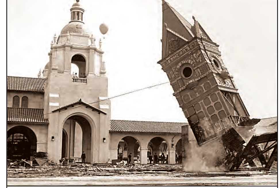
The original Santa Fe Depot tower coming down in 1915.